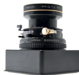
Alpagon 5.6/70 mm