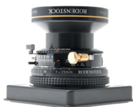
Alpar 4.0/35 mm