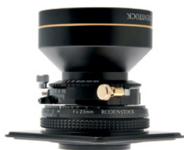
Alpagon 5.6/23 mm